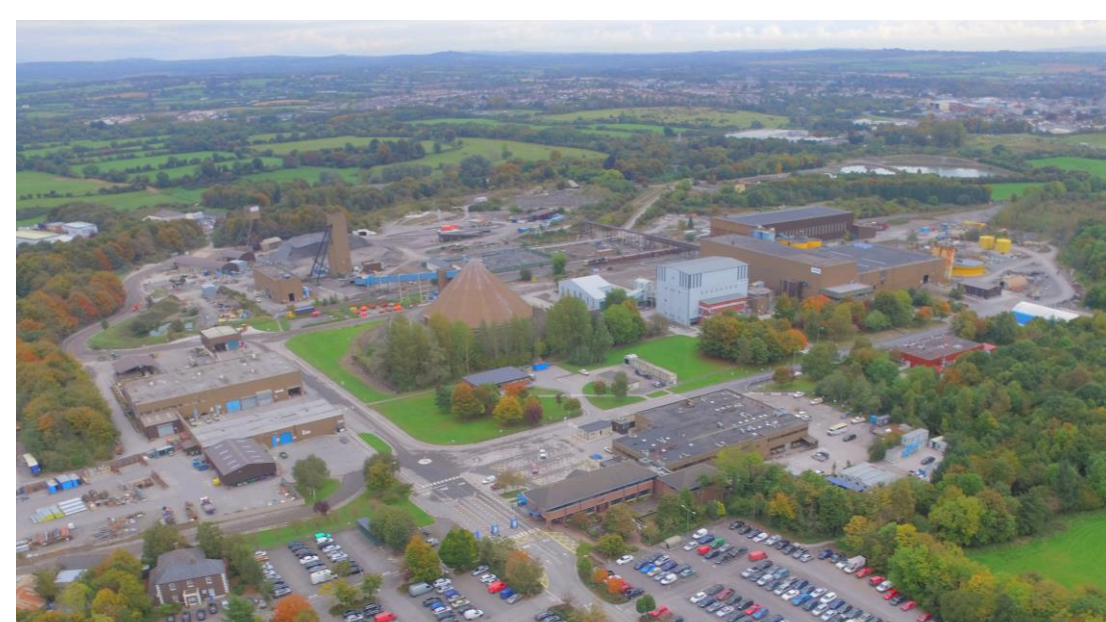
Tara Zn-Pb mine (Ireland)