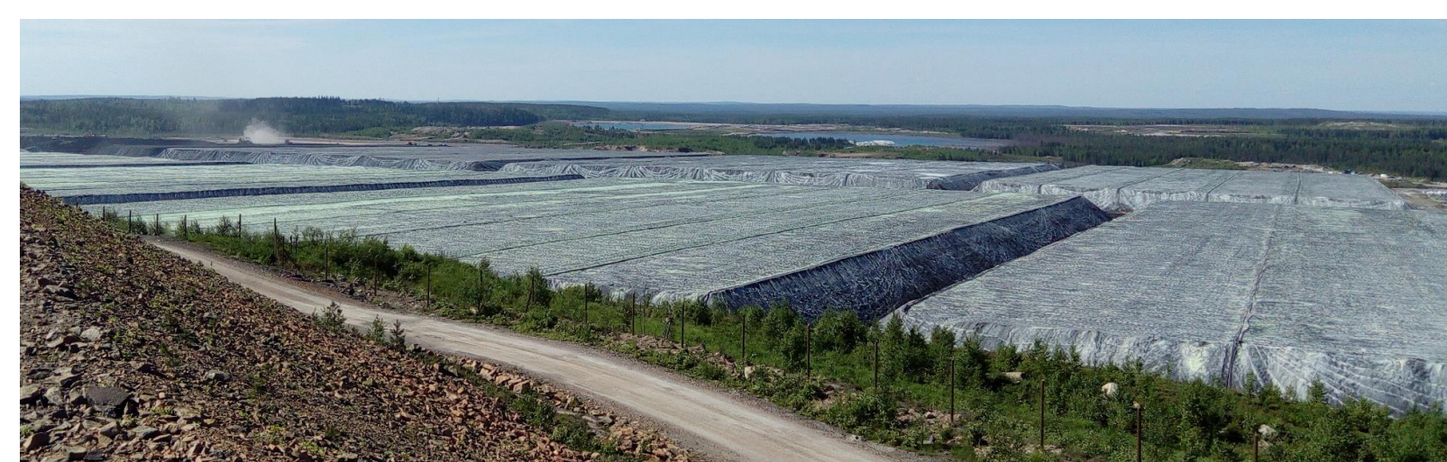
Sotkamo Co-Ni-Cu-Zn-mine (Finland)