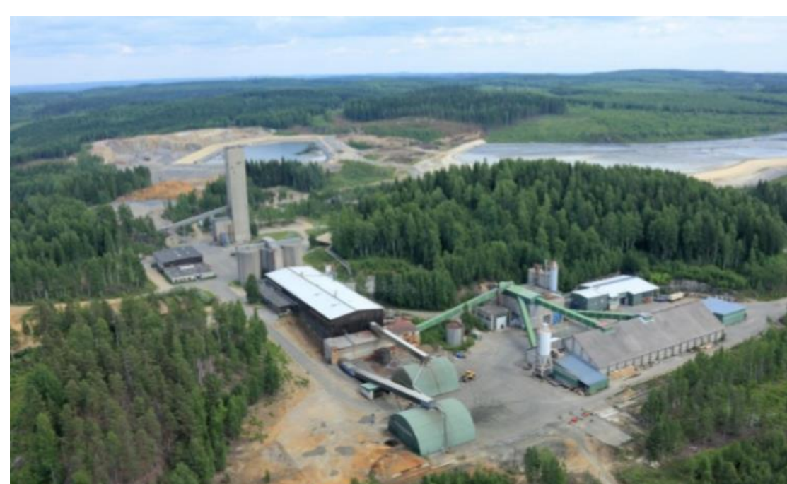
Luikonlahti Cu-Zn-Au processing facility (Finland)